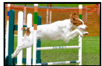
Completed her Novice Agility title this Oct 2nd & 3rd 2010

There are several different categories that dogs can compete in. Dixie competes in Standard, which is what you see on T.V., and she also competes in JWW (Jumpers with Weaves). We are proud to say that on Saturday, October 2 nd Dixie got a first place ribbon in Standard and in Jumpers. Sunday, October 3 rd , she got a 2 nd place in Standard - completing her Novice Agility Title.