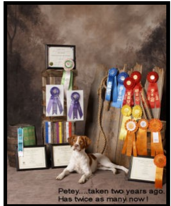
Petey....taken two years ago. Has twice as many now!