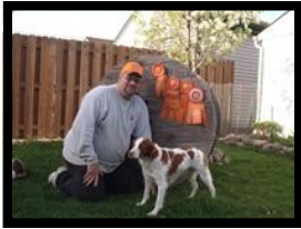
Ginger Moonpie Maverick