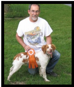
Shaker agreed that this was for him, so we signed up with the GMBC that week.

To end the year and start a new one, we went to the annual awards banquet where we received a plaque for earning a JH title.